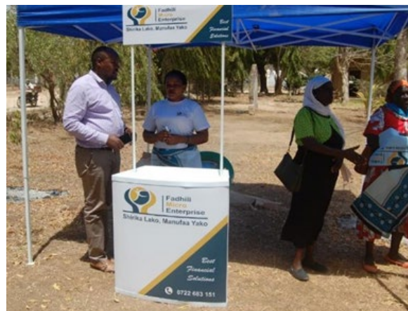
Mobile banking kiosk managed by the Fund's client, Fadhili Microenterprises Limited

The Impact for Northern Kenya Fund disbursed its third loan to Agricultural Finance Corporation (AFC). Per the Fund's requirements, AFC will provide matching capital on a pari passu basis and use the capital for on-lending to producers and micro, small, medium and microenterprises (MSMEs) in select Frontier Counties Development Council (FCDC) counties.